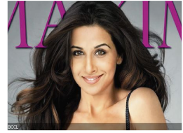
Vidya Balan in a bikini!