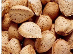
Diabetic? Forget pills, pop almonds